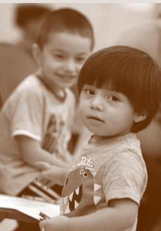
Two boys meet while waiting for parents to finish shopping at the Pantry on a Saturday morning.