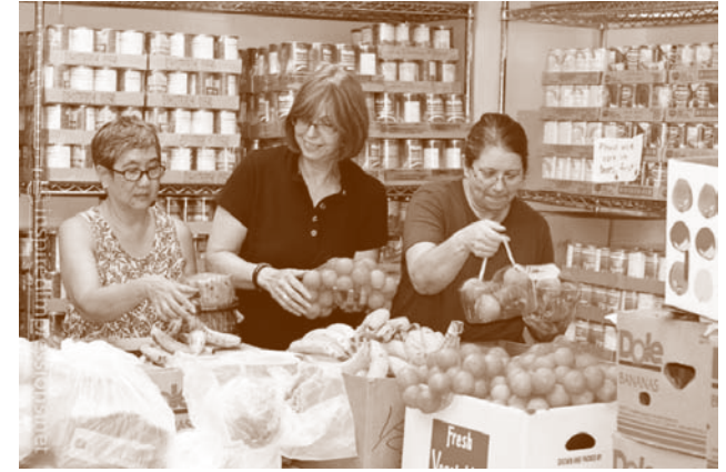
Volunteers sort a bountiful harvest from a Trader Joe's produce rescue.

We expanded our food "rescue" program by recruiting more local grocers and bakers to donate useable but not perfect fresh produce and bread. Joining our list of donors were Door to Door Organics, Greater Chicago Food Depository (GCFD), Montalbano Farms, Panera Bread, Penzeys Spices, Red Hen Bread and Ultra Foods. GCFD provided free vegetables and bread as well as meat for four-cents a pound. Vegetable garden bounties were gratefully received from Cheney Mansion, Dominican University, Fair Oaks Presbyterian Church, Hatch Patch, OPRF High School, Oak Park Temple, St. Giles Church and individual gardeners.