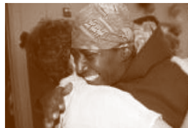
A happy client hugs Pantry staff.

The effort required more hours from our growing corps of volunteers, who collected, sorted and bagged more than 1,000 pounds of fresh food per week for distribution. Pantry Manager, Paula Berg, earned a state Food Handler license, which qualified the Pantry to offer fresh food.