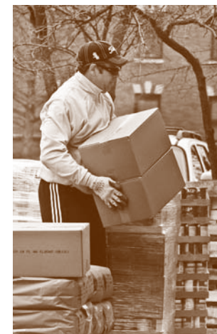
On a cold winter day, volunteers help unload 10,000 pounds of food.

“I view our food pantry as a service organization,” Braun said. “And exceptional service is what makes an organization successful. I always want both our volunteers and clients to walk away with a good feeling – whether they were being served or serving.”