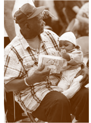
Grandpa and granddaughter wait for their turn to shop on a Wednesday afternoon at the Pantry.