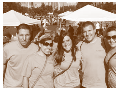
Ninety-two volunteers step out for the Annual Hunger Walk on our behalf.