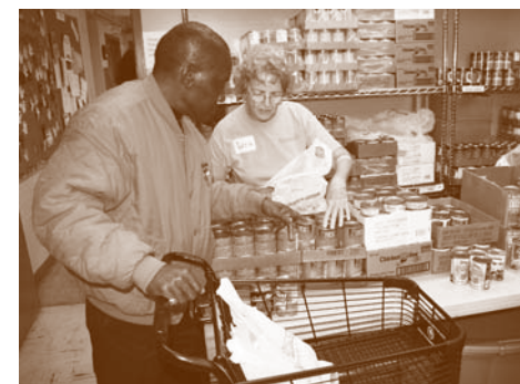
Volunteers closely assist clients during client choice.

We participated with other anti-hunger advocates on lobbying initiatives in Springfield and Washington D.C. Throughout the year we communicate with legislators regarding hunger relief legislation, and we mobilize volunteers to participate in advocacy.