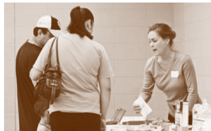
A family receives nutrition education resources on a Saturday morning at the Pantry.

We increased the amount of nutrient-dense foods, especially fresh fruits and vegetables, and protein-rich foods such as lean meats and low-fat dairy products. This was instrumental in helping us move beyond the "hand out whatever you have" model to becoming a center for more healthful eating.