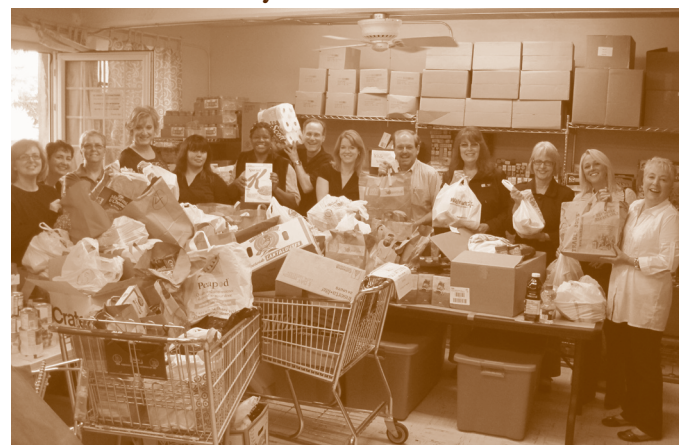
Delivery day for Baird & Warner.

branch office made the first donation to the campaign - $1000. In all over 1800 non-perishable items and over $1,936 was raised to help needy families. Thank you Baird & Warner for your donations and for the creative way you worked to raise awareness of hunger in our community.