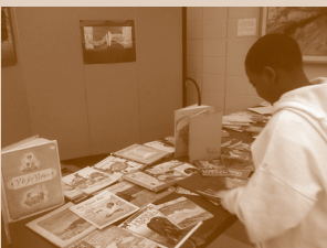
So many books to choose from!