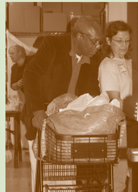
Pantry volunteers work closely with clients on food choices.

“Now, if I don’t want an item, I can leave it for someone else.”