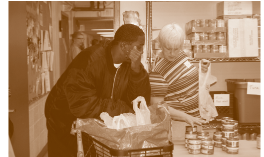
Pantry volunteers work with clients in choosing food.

the Greater Chicago Food Depository and from gifts honoring the memory of Beth Drews.