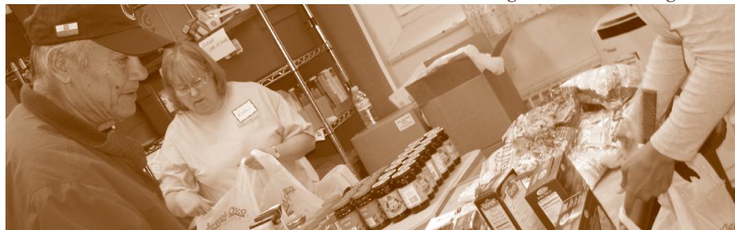
Many selections to choose from.

The changes at the pantry are made possible by an award from AT&T, a grant from Kraft Feeding Possibilities Program via